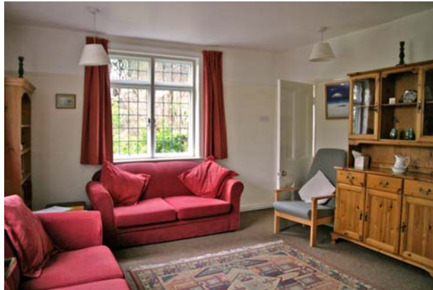
The Cottage Lounge